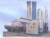
CO 2 Production Plant